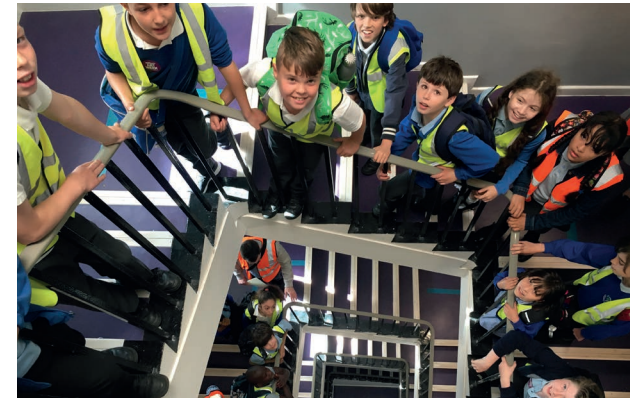
'The whole experience enhanced their understanding of, St Andrew's Primary School at Bath School of Art and Design and participation in, the creative process.' 'They will return to the classroom with enhanced communication skills, and an outward looking, confident approach and a raft of new skills."