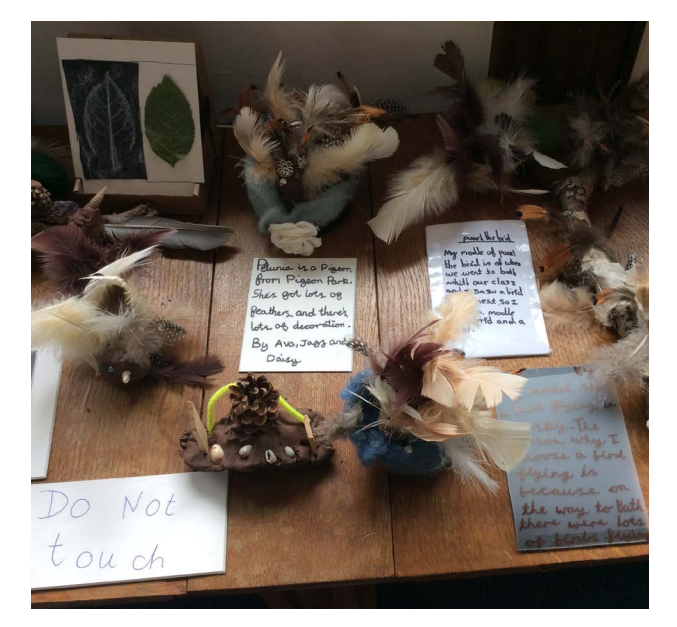
Exhibit your collection - 'We are building an outdoor museum. Find a way to exhibit the favourite object that you collected this morning. Working in sub-groups of 2 or 3.'

'Imagine you are one of the volunteers, and present your favourite object to us' I led a whole class promenade performance - visiting each room of the museum and the children performed little scenes as volunteers/embodying the objects themselves.